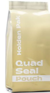
Quad Seal Pouch