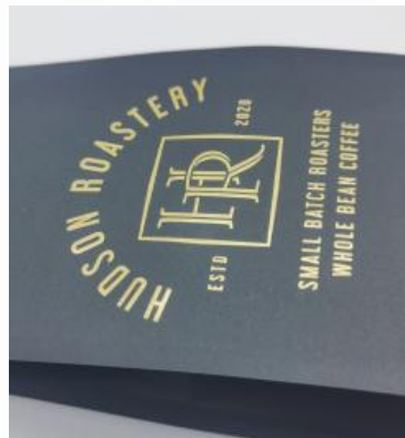
Hot Stamping/Gold foil