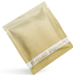
Flat Pouch/drip bag