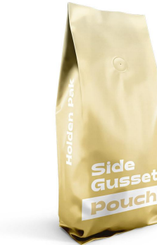
Side Gusset Pouch