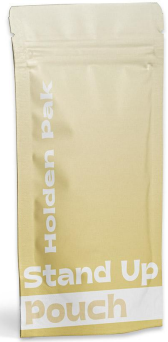
Stand Up Pouch